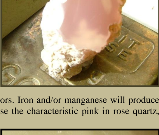
Photo of ~12 carat <u>ruby from the central Laramie Range</u>, <u>Wyoming</u>, one of several ruby deposits <u>discovered</u> by the author using geological detective work. This particular ruby

Cleavage – Quartz does not have <u>cleavage</u> (most of the time). In other words, you are not going to break quartz along distinct planes like diamond. If you strike quartz with a chisel and hammer to try to cleave it like you would a large diamond, the quartz will just break along <u>conchoidal fractures</u> (like broken glass).